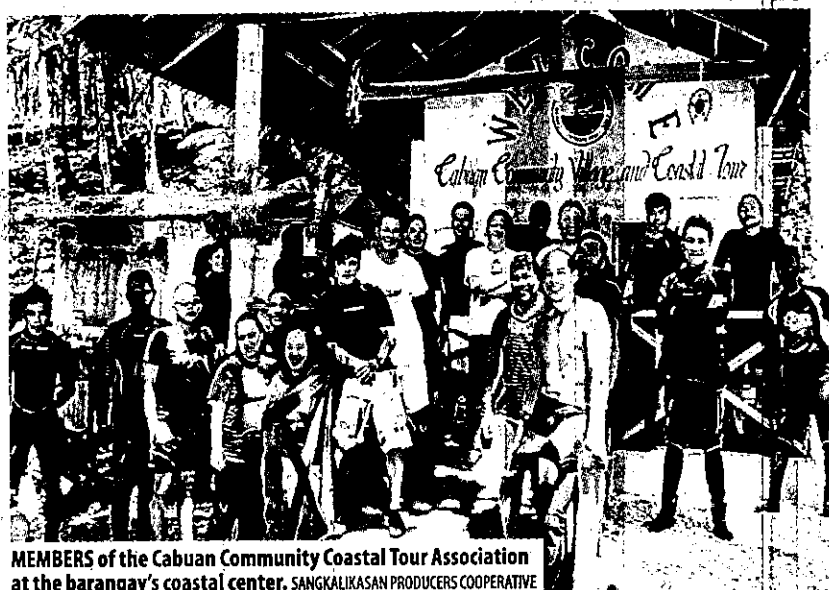
MEMBERS of the Cabuan Community Coastal Tour Association at the barangay's coastal center.

of SPC, presented the organization's accomplishment as a program collaborator during the Sixth General Assembly and Convention of the Philippine-Korea Rural Development Administration Alumni Association (PhilKoRAA) on September 29 and 30 at the DOST-PCAARRD Innovation and Technology Center (DPITC), in Los Baños, Laguna.