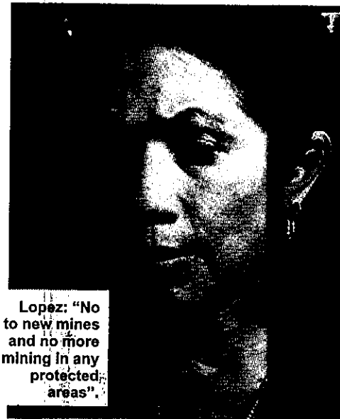
Lopez: "No to new mines and no more mining in any protected areas".

"Projects in Singapore, the United States and the United Kingdom