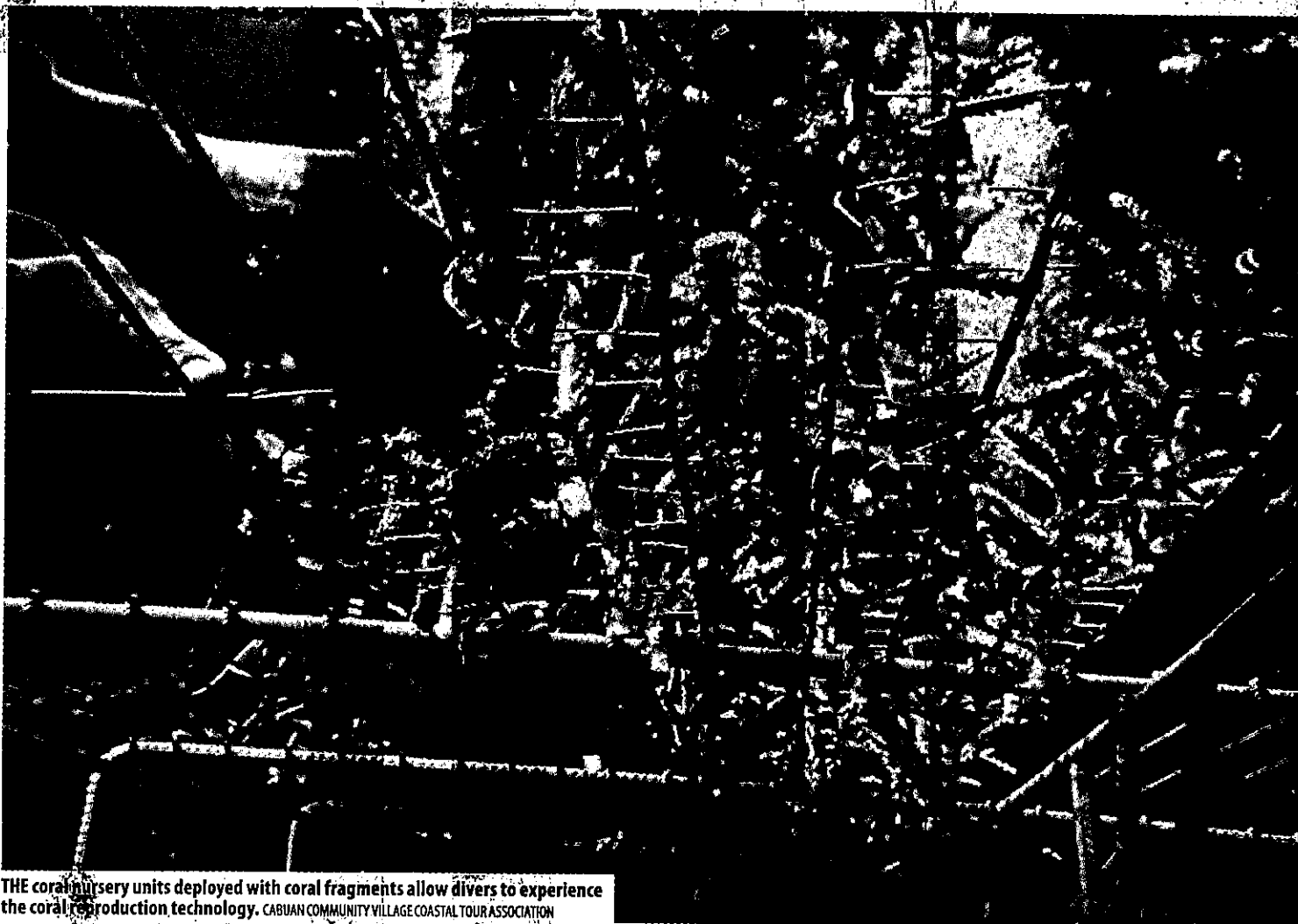
THE coral nursery units deployed with coral fragments allow divers to experience the coral reproduction technology. CABUAN COMMUNITY VILLAGE COASTAL TOUR ASSOCIATION