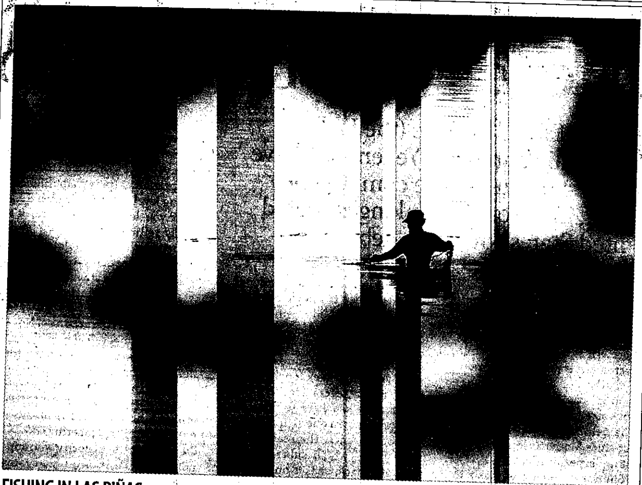
FISHING IN LAS PIÑAS A fisherman in the coastal area of Las Piñas takes advantage of calm weather to gather his fishnet.

DENR bans housing projects near watersheds