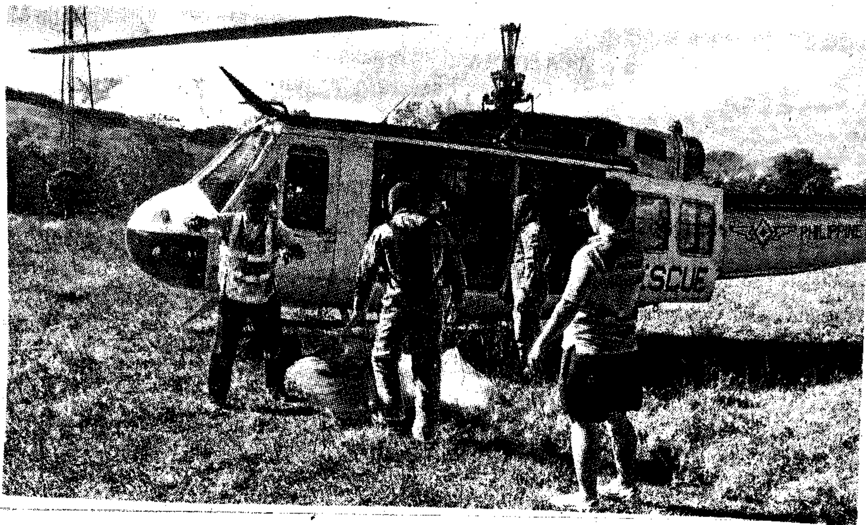
VOLUNTEERS load sacks of crushed ice onto a military helicopter that is helping fight the raging fire on Mt. Apo, the country's tallest peak.