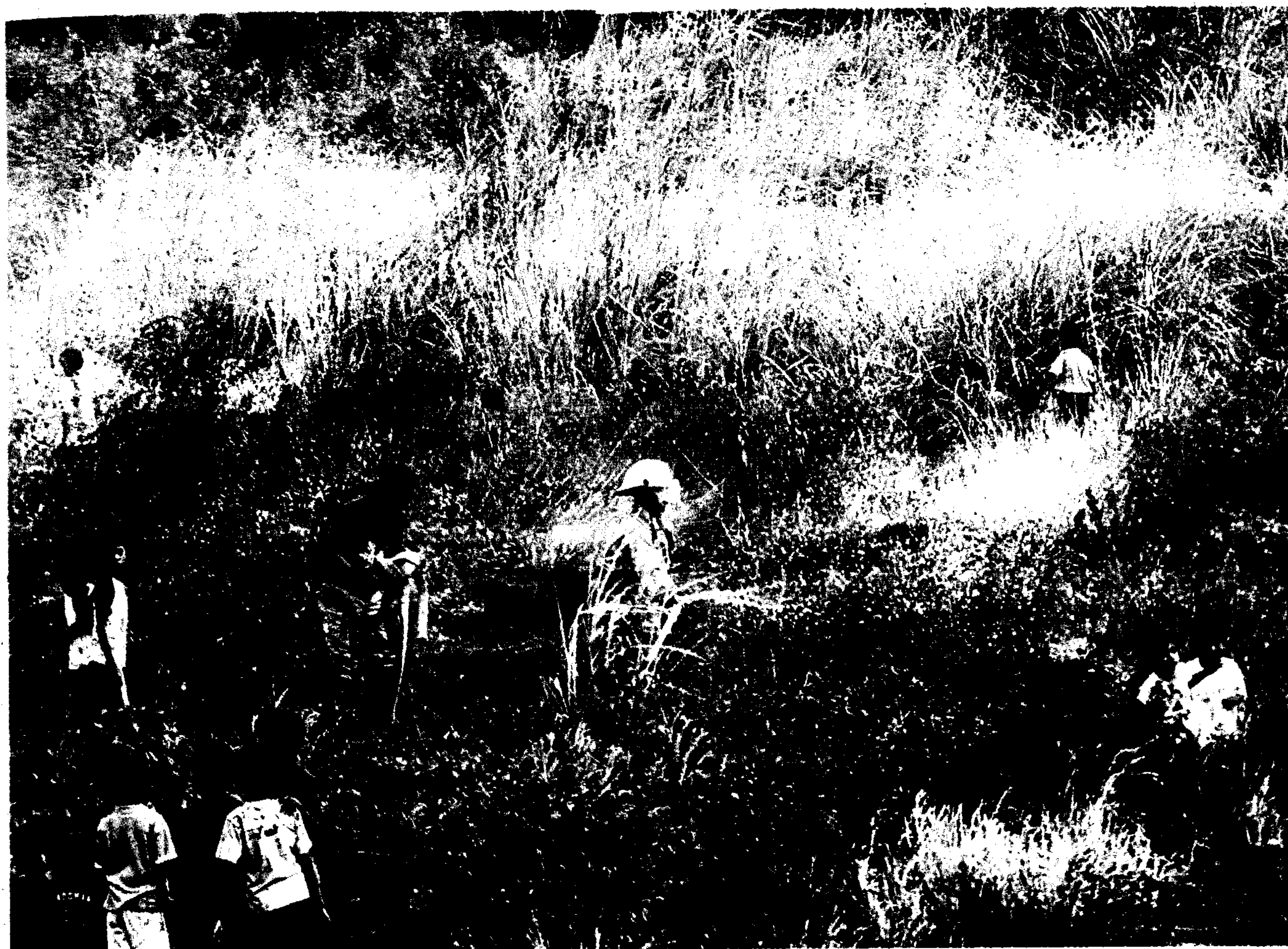
FIELD OF GRASS ON FIRE — Fire brigade volunteers train their water hoses on grass burning due to intense heat in an open area in Brgy. Jagoblao, Mandaue City. The Mandaue City Fire Department received a fire alarm at around 4 o'clock in the afternoon yesterday and the fire was extinguished by the city's firefighting personnel minutes after the alarm. No dwellings in the area were affected.