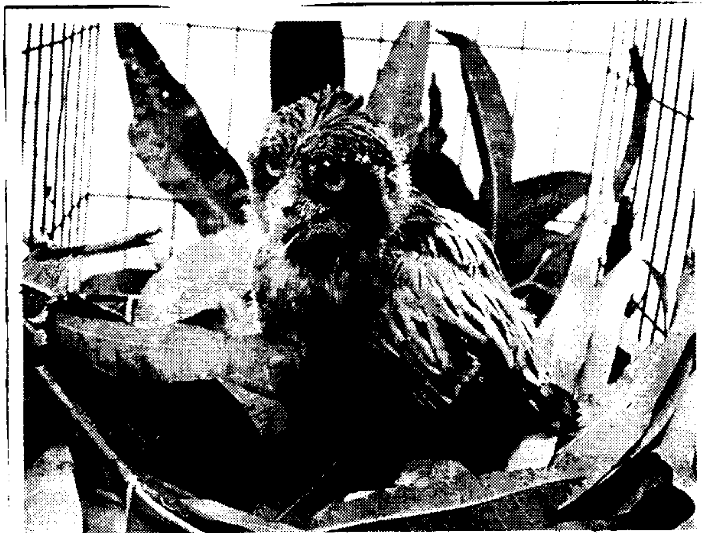
Ang Philippine Eagle na ito ay kabilang sa 47 endangered species na tinangkang ipuslit palabas ng bansa patungong Japan nang masabat ng mga alertong Customs examiners.