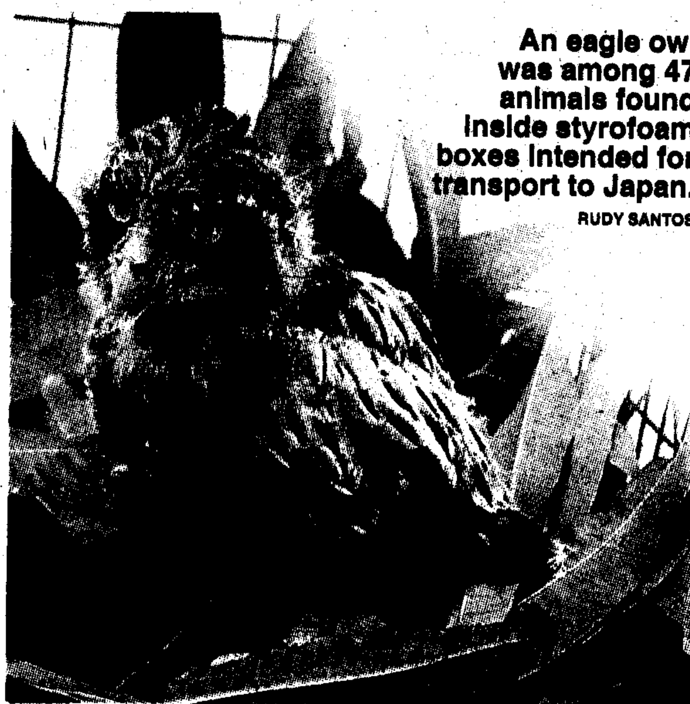
An eagle owl was among 47 animals found inside styrofoam boxes intended for transport to Japan.