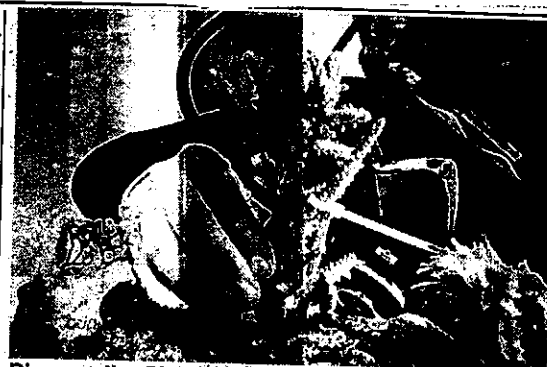
Diver applies Pioneer Epoxy Clay Aqua to attach coral fragment.