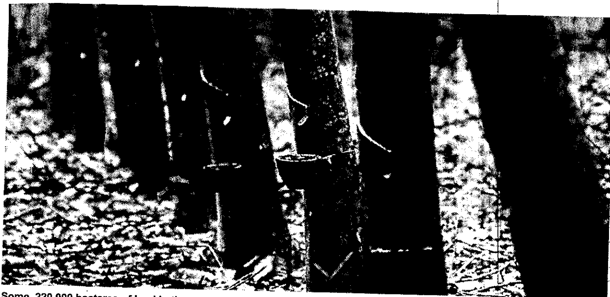
Some 220,000 hectares of land in the country are planted to rubber.

Galang also said that the local rubber industry is valued at around P11.6 billion at current prices of $2.11 per kilograms of rubber.