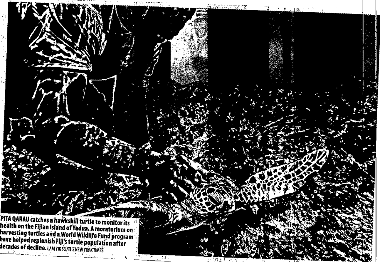
PITA QARAU catches a hawksbill turtle to monitor its health on the Fijian Island of Yadua. A moratorium on harvesting turtles and a World Wildlife Fund program have helped replenish Fiji's turtle population after decades of decline.