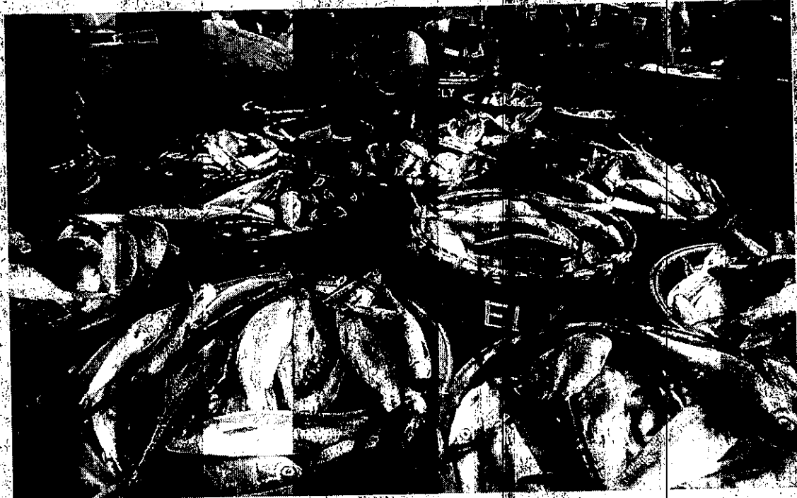
A worker sorts newly harvested "bangus" (milkfish) at the Magsaysay fish market in Dagupan City.

According to the Philippine Statistics Authority, Pangasinan produced an annual average of 106,857.37 MT of bangus from 2013 to 2015, making it the coun-