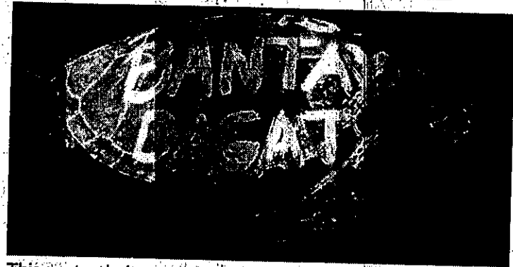
This sea turtle, its carapace vandalized, has been returned to the waters of Silay City in Negros Occidental.